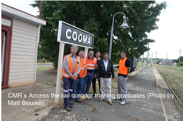
CMR's Access the rail corridor training graduates

During the training, course participants developed an