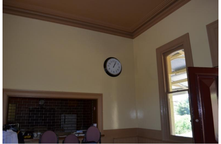
CMR's newly installed Waiting Room wall clock