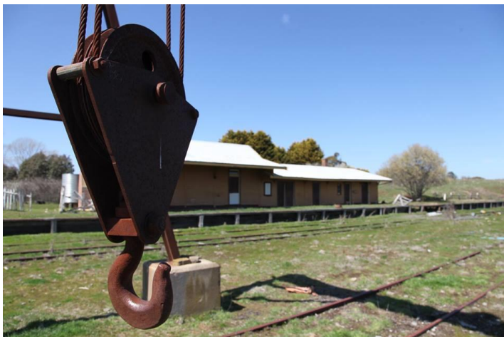
5 ton goods crane, Nimmitabel.