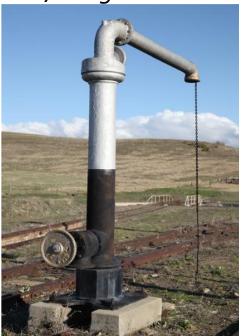
Water Column. CMR.

Thanks to Robert Carter and myself for the photos so far, but now it's your turn! If you have any quality photos of the precinct, or examples of heritage or contemporary rolling stock, please forward them to me at publicity.officer@cmrailway.org.au for inclusion in this programme. Recognition, of course, will be given, with your name appearing within the frame and a limited run of 25 frames per image. Some examples have already reached 7 images sold!