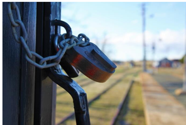
SRA padlock, 4 wheeled powder van, Cooma yard.