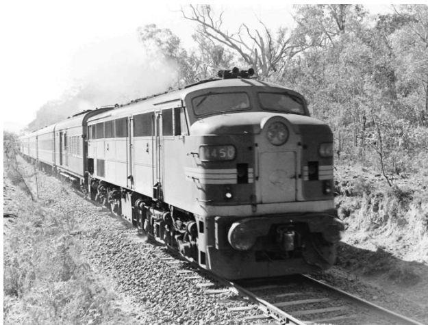
Cooma Monaro Express, Royalla.

We currently have a vacancy available for an Events and Services Manager which involves organising tours bookings, events such as car clubs, fetes and possible catering. If you feel you could handle these responsibilities, please contact us at manager@cmrailway.org.au