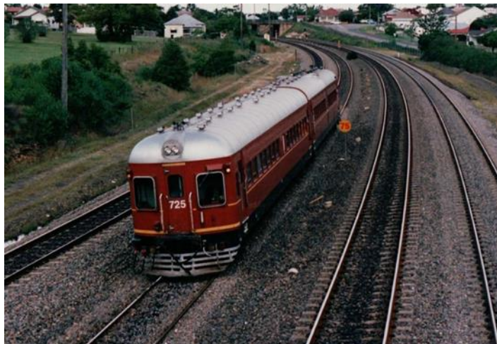
Our very own 625/725 hard at work in revenue service, Victoria St, Hunter Valley.

a copy of the strategic plan please email us at: publicity.officer@cmrailway.org.au and we will forward it to you.