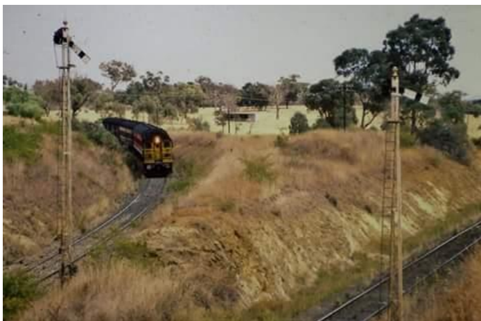
4422 hauls the northbound Cooma Mail into Queanbeyan. March 1985.