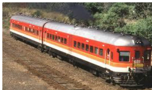
620/720 rail motor in candy.

With this delay in the rollout of the works program it will be unlikely that CMR will see the opening of a museum any earlier than this time next year.