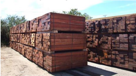
The sleepers needed to get CMR back on track

You can be involved and help support this great initiative by “sponsoring a sleeper”. When sponsoring a sleeper you will receive: a personalised Certificate of Appreciation, entry into a permanent register for display by Cooma Monaro Railway Inc. for future generations to observe and a tax deductible receipt for the amount of your donation. At $60.00 a sleeper this is a small investment for a big cause!