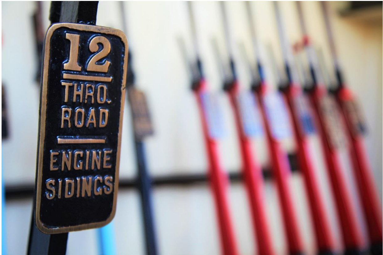
Switches inside the Cooma signal box.

Well, it's time to swing a switch and move this Express out, so until next time....ALL ABOARD!!!